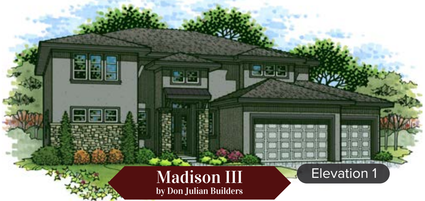
Madison III by Don Julian Builders