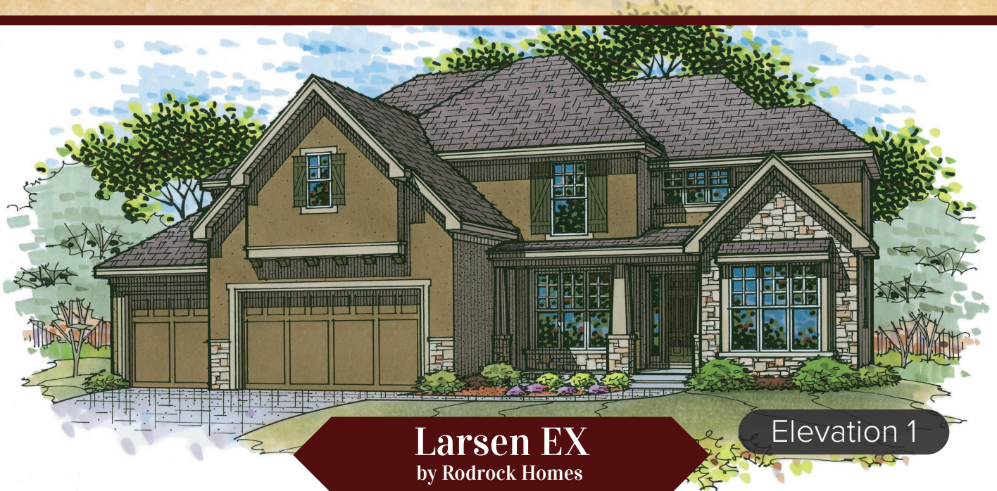
Larsen EX by Rodrock Homes