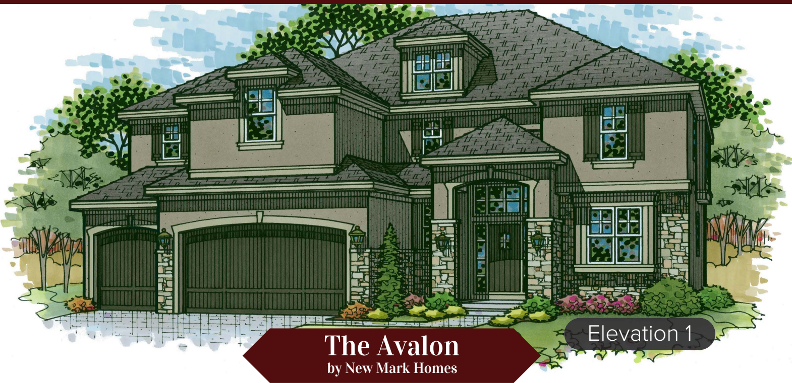
The Avalon by New Mark Homes