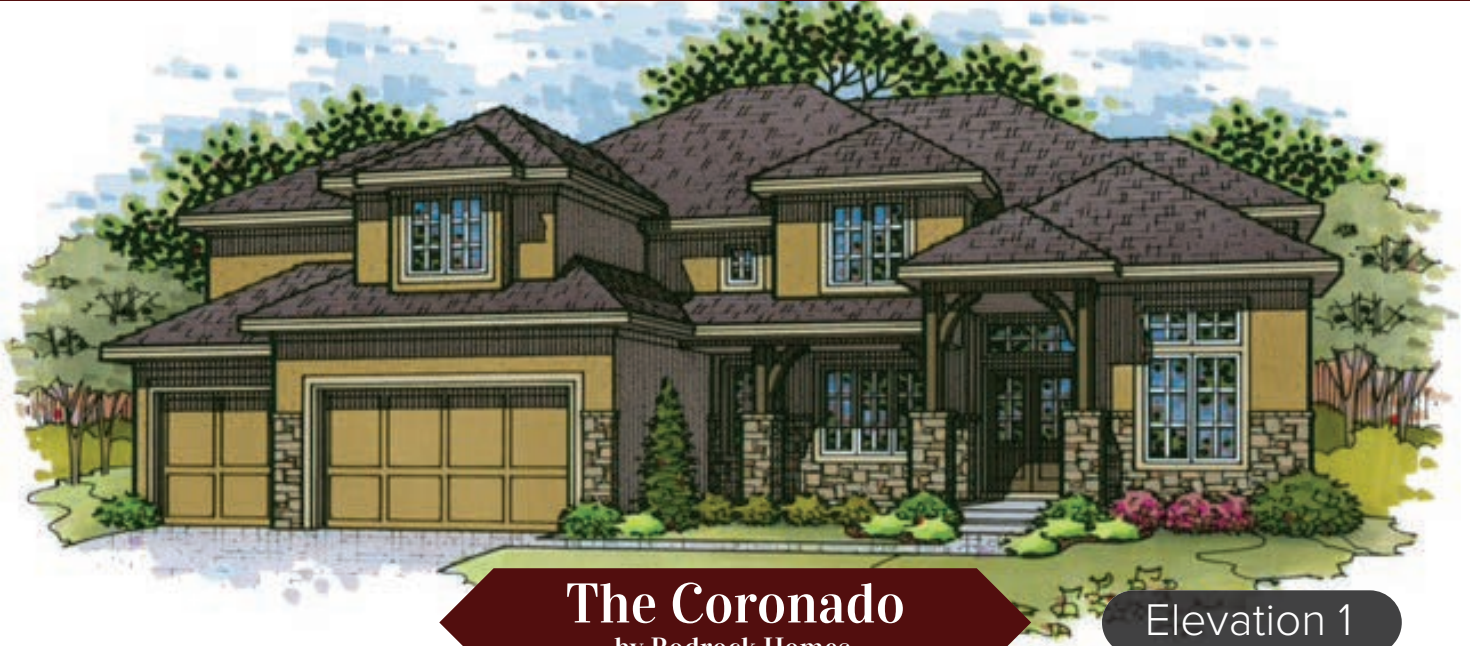
The Coronado by Rodrock Homes