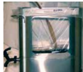
7. Pour in beverage.