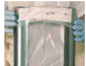
6. Drape liner over outer rim of urn.