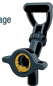
Eliminate faucet bacteria buildup

The Saftea® Urn Liner assures beverage freshness, optimal flavor, and safe consumption. Sanitation is greatly improved and the risk of bacterial and mold contamination is greatly reduced.