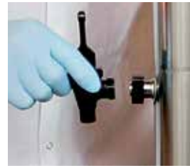
1. Unthread existing faucet.