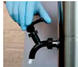
5. Straighten tube. Close faucet.