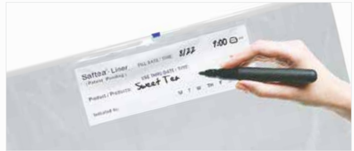
Writable information strip for easy date/time notation

Each liner has a white, writable information strip, allowing easy date and time notation of each new beverage batch, as well as the date and time to remove liner to ensure continued beverage freshness and sanitation.