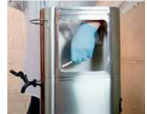
4. Place liner in urn. Feed tube through faucet opening until tube protrudes.