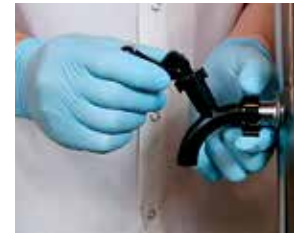
2. Replace with new Saftea® Pinch Tube Faucet (see available faucets below).