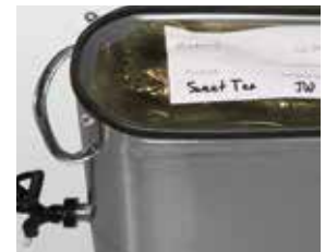
8. Close zip-lock seal on liner. Tuck inside urn. Close lid.