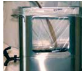
7. Pour in beverage.