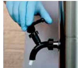
5. Straighten tube. Close faucet.