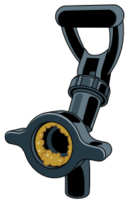
Eliminate faucet bacteria buildup

The PanSaver Saftea® Liner assures beverage freshness, optimal flavor, and safe consumption. Sanitation is greatly improved and the risk of bacterial and mold contamination is greatly reduced.