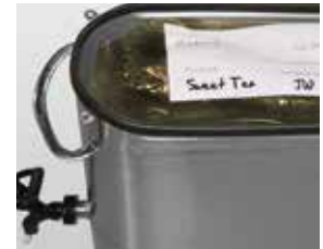
8. Close zip-lock seal on liner. Tuck inside urn. Close lid.