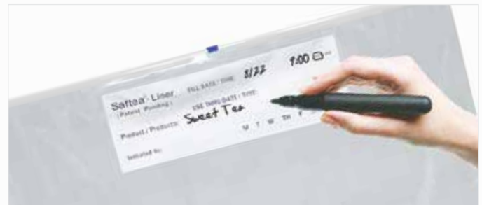
Writable information strip for easy date/time notation

Each liner has a white, writable information strip, allowing easy date and time notation of each new beverage batch, as well as the date and time to remove liner to ensure continued beverage freshness and sanitation.