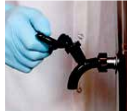
3. Open faucet.