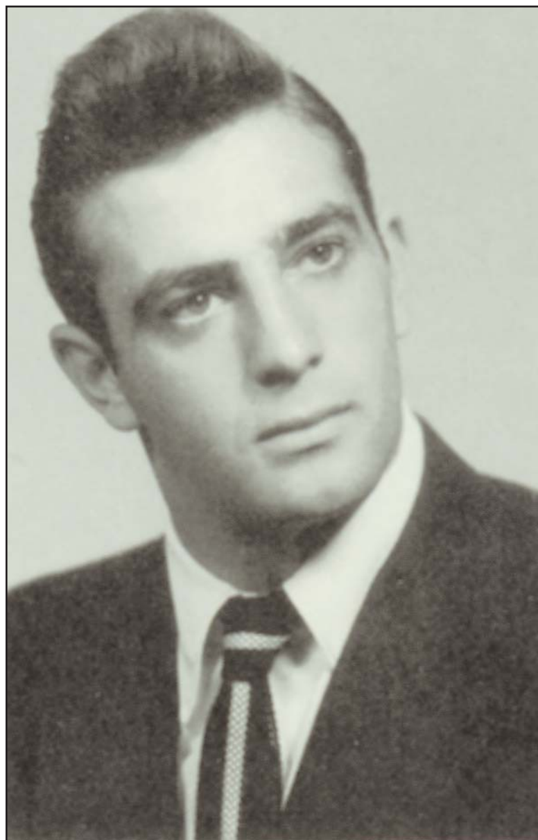
1956 CHRONICLE

"I always played with the older kids because I used to go