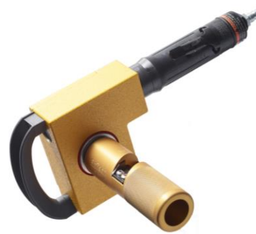
AnTech's Stripping Tool