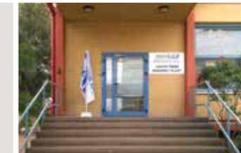
S.G.D. Assembly Plant