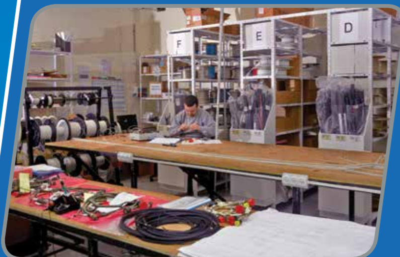
Harnesses Production Department

S.G.D Engineering Ltd. is a leading provider of Innovative Airborne Solutions for both the military and civil aviation markets, with more than 140 projects worldwide.