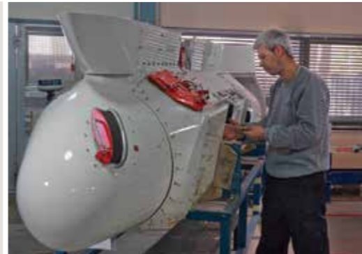
Airborne Pods – DB-110