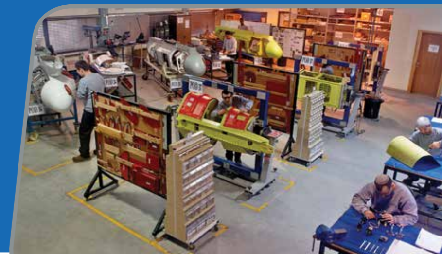
Pods' Assembly Line