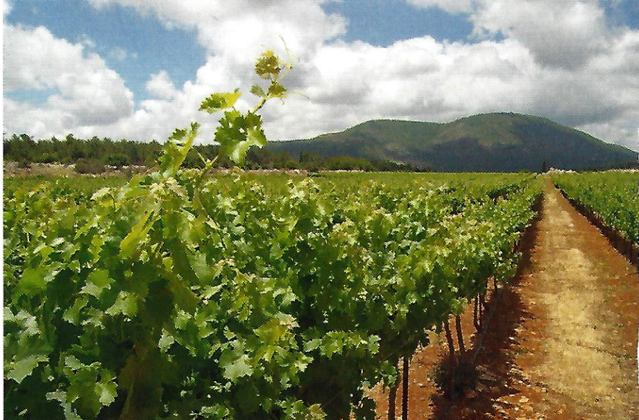
Above: the Kayoumi vineyard in Galilee, in the foothills of Mount Meron