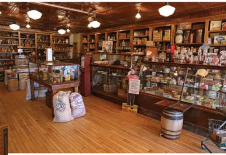
General Store Museum Collection, a working ice cream parlor and candy store, and rotating exhibitions of the Cedarburg Cultural Center's Rappold-Dobberpuhl historic photograph collection.