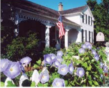
1849 Kuhefuss House Museum

Approximately 2 ½ hours • Includes: 1849 Kuhefuss House Museum • Turn of the Century Schoolroom Walking Tour of Cedarburg's National Historic District • Scavenger Hunt $4 per student • Chaperones free • No strollers, please.