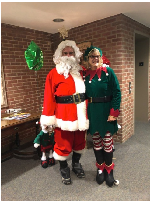
Santa and his helper stopped by Second Baptist Church!

The annual Martin Luther King, Jr., service of celebration is being planned for the afternoon of Sunday, January 19 th . The service will be held at the Third Baptist Church and is always an inspiring and empowering service to remember that we are all sisters and brothers in this world and are called to love, serve and care for all. More details will be coming on the precise time, preacher for the service and music. Save the date and invite friends, family and neighbors.