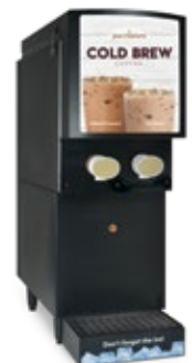
2-Port Model # GW-2BLK 9.5"W x 21.5"D x 24.25"H Head clearance when open: 44.5"