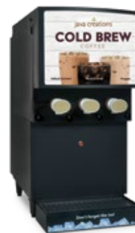
3-Port Model # GW-3BLK 13.5"W x 21.5"D x 24.25"H Head clearance when open: 44.5"