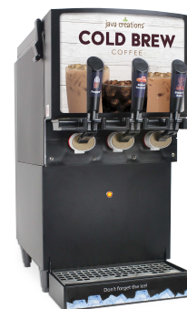
3-Port Tap Model #GW3BLK 13.5"W x 21.5"D x 24.25"H Head clearance when open: 44.5"