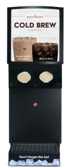
2-Port Model #GW2BLK 9.5"W x 21.5"D x 24.25"H Head clearance when open: 44.5"