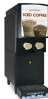
2-Port Model # GW-2BLK 9.5"W x 21.5"D x 24.25"H Head clearance when open: 44.5"