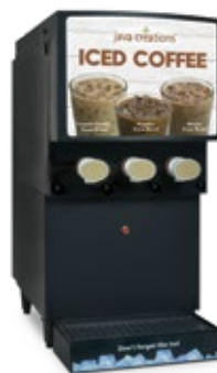
3-Port Model # GW-3BLK 13.5"W x 21.5"D x 24.25"H Head clearance when open: 44.5"