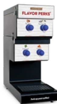
4-Port Model #GWTS4 9.5"W x 22.5"D x 28"H Head clearance when open: 39.75"