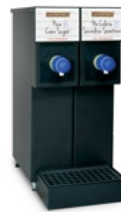
2-Port Model #GWTS2 9.5"W x 14"D x 21"H Head clearance when open: 21"