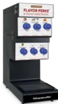
6-Port Model #GWTS6 9.5"W x 22.5"D x 28"H Head clearance when open: 39.75"