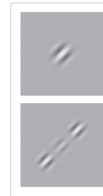
Figure 1.0 Gabor patches - Single (top) and three at 45° angle (bottom)

A more detailed explanation of the science, including links to medical journals and a full list of clinic trails, can be found at www.RevitalVision.com/Doctors