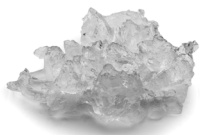
MF 36 Flake ice Residual water content 25%