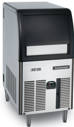
Routine Maintenance Alarm