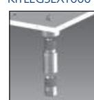
Available as optional KITLEGSEXT000