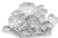
MF 46 Superflake ice Residual water content 15%