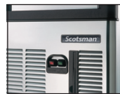
Front ON-OFF Switch Storage bin antibacterial pouch & holder