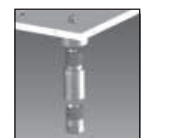
Available as optional KITLGSEXT000