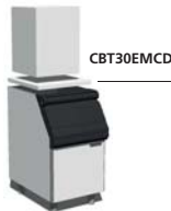
MV426+SB530+Top (sold separately)