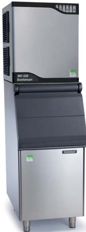
MV 426 with SB322 (sold separately)