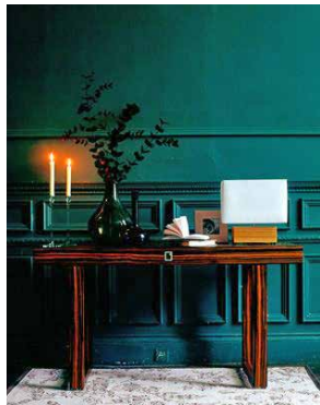
Deep and moody greens

Cool Grass Greens that add a soft gentle and subtle feel for your home. Jade is a gorgeous colour that adds an impact to your décor without being overly brave. A statement furniture piece like a sofa is enough to pack a punch without knocking anyone out – check out the bespoke Jade sofa from Love your home (1).