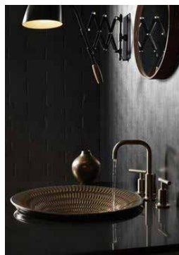
Metal bathroom sink