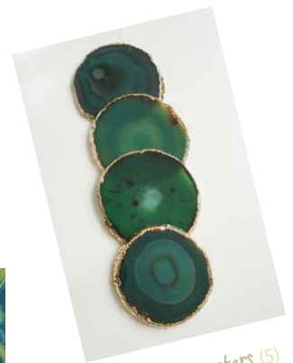
Agate coasters (5)