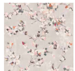
Japanese style wallpaper – Floris by Romo, Brewers Exeter (2)