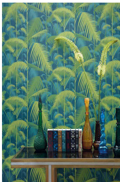
Cole & Son Palm Jungle wallpaper in rich blues and greens (3)