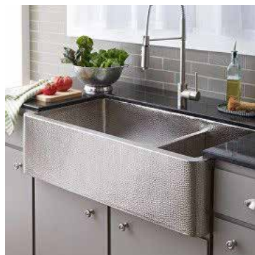
Nickel kitchen sink

If you are thinking about updating some of your appliances for example sinks to stainless or replacing stainless think, again! This material is on its way out and you'll see this by checking out some of the best world known manufacturers. Of course, you'll still be able to purchase it and that price will probably become lower and lower. Have a good look around at more intricate and detailed finishes these are set to raise the bar and stay. They therefore will be an investment. The days of having everything matching in your kitchen and bathroom have gone. People are becoming more adventurous and aren't scared to add different colours, textures, and finishes. Metallics, hammered finishes, I see this in very simple items like kettles or pots for cooking. Different finishes are on the up and aren't going anywhere - see below: