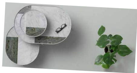
Marble patch tables (6)

A great way to introduce bold prints or colour is by using wallpaper. You can do this using a feature wall if you are slightly unsure whether to go really, bold in a larger room then try a strong wallpaper print in your powder room/downstairs loo. Botanical prints are set to be bang on trend. Japanese prints are right on trend if you may prefer something unusual, pretty that will still make a statement (2).