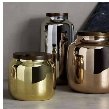
Shiny metallic pots

Cole & Son Iconic Palm Jungle – Stunning mixture of greens & blues a great backdrop for layering with emerald and deep red colours or using bold, interesting furniture pieces (3).