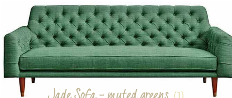
Jade Sofa – muted greens (1)