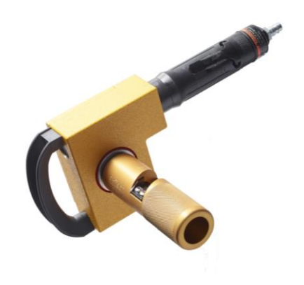
AnTech's Stripping Tool