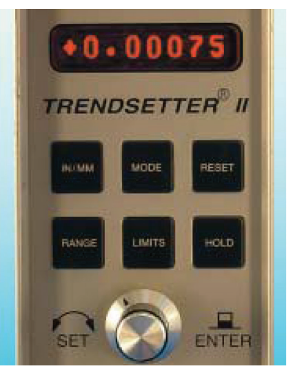
Setup is accomplished easily using six keys and the alphanumeric display on the front panel.