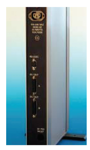
RS-232 ouput and analog ports are conveniently located on rear side