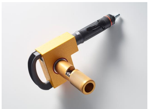
AnTech's Stripping Tool