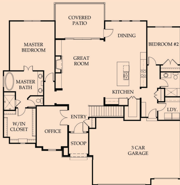
MAIN LEVEL 2,082 SQFT