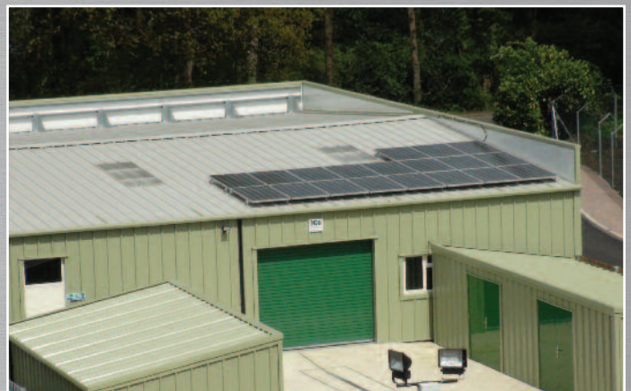
Showroom building with PV generation and two steel framed mono pitch storage buildings