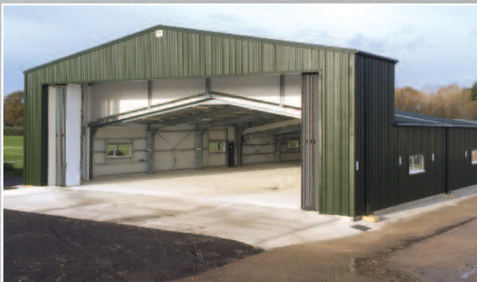
A highly unconventional aircraft hangar with bespoke insulated sliding door system