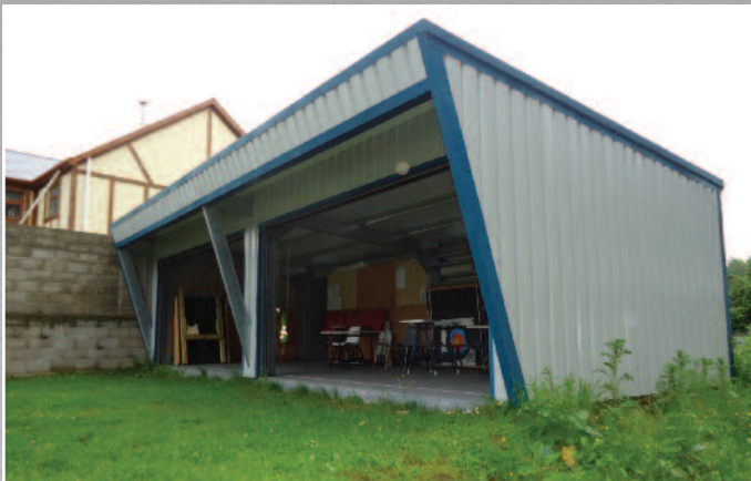
3CB Mono pitch building with overshoot roof for an archery and rifle range