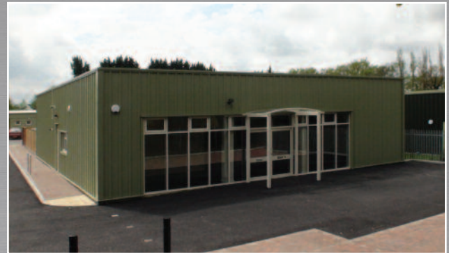
A showroom building supplied and constructed by ourselves incorporating glazed walling, entrance porch and block paving