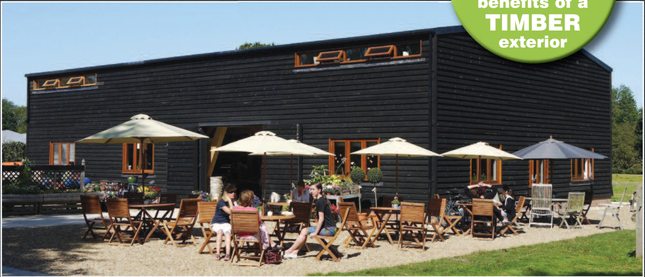
3CB Steel Framed Farm Shop

all the benefits of a STEEL building with the added benefits of a TIMBER exterior