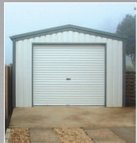
A typical single garage – readily constructed by self-builders