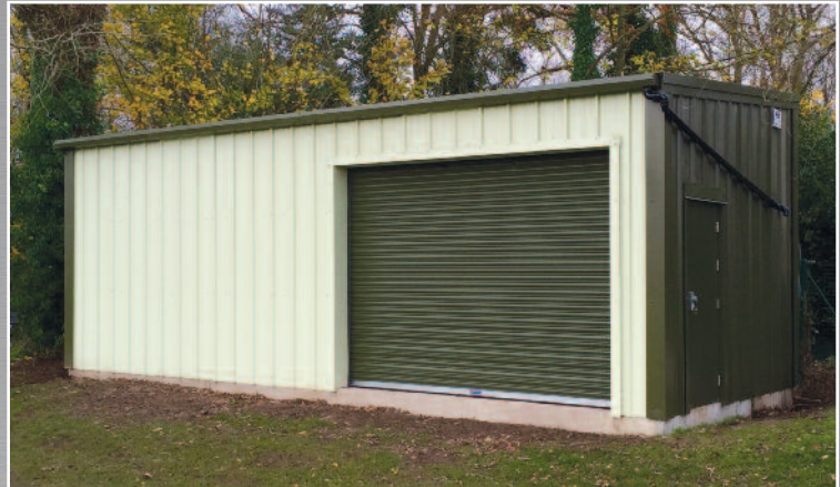
Even more unusual buildings can be undertaken by self-builders

We can offer a building solution in complete 'kit' form with all structural members drilled and cut to length and include all the necessary nuts, bolts and washers together with assembly drawings and a build manual all included within our highly competitive price. Our buildings are designed and manufactured to such exacting standards that the Self Build route is a real practical option offering the chance of further cost savings. Consequently many of our Customers choose the Self Build route if they have the capacity and the reasonable level of skill necessary. Should you choose this route and run into problems then we are on the end of a phone or can offer on-site supervisory assistance if required.