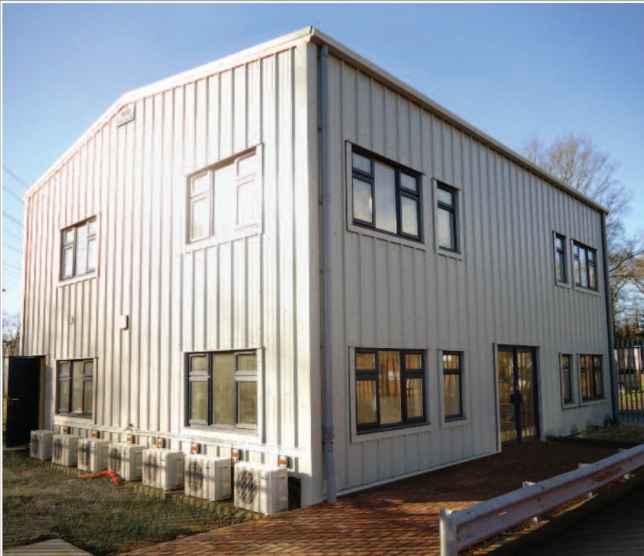
One of our steel framed buildings fitted out internally for office use - making for a highly cost effective solution

This is a small selection of images showing just some examples of the extensive range of styles and sizes of building we have designed and installed over the years.