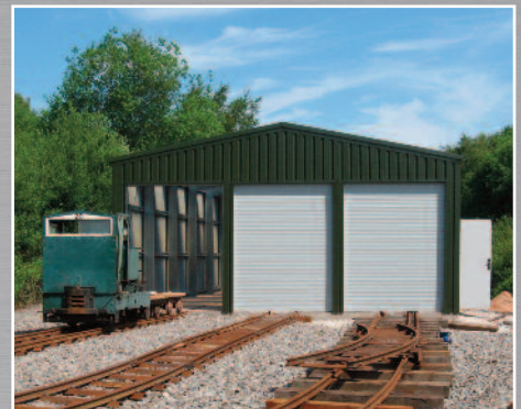
Steel framed light railway workshop