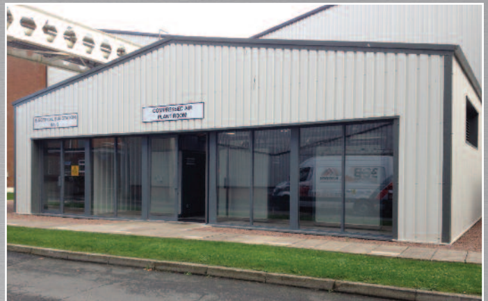
One of our facilities buildings with glazed front and ventilation louvers