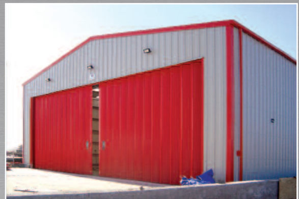
Helicopter hangar building with concertina door system