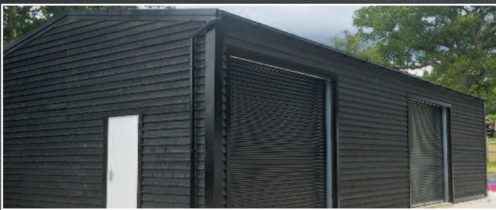
A high specification timber clad workshop in black feather edged board