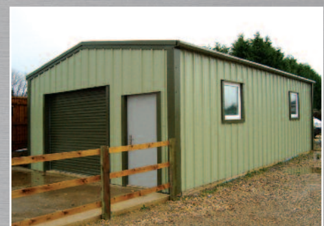
Typical garage installation with windows, roller door and personal access door – an ideal self-build project