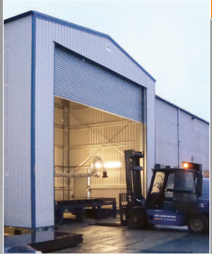
6m facilities building with fully louvred walling for ventilation

Naturally all of our processes are tightly controlled since we are fully accredited by BSI to ISO 9001:2008 standard.