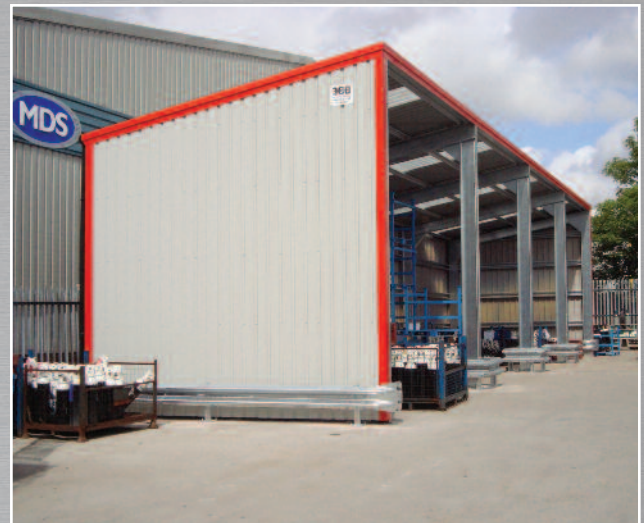
One of our open fronted mono pitch storage units with our barrier system installed