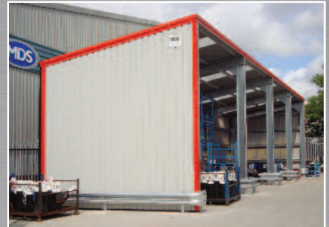
One of our open fronted mono pitch storage units with our barrier system installed