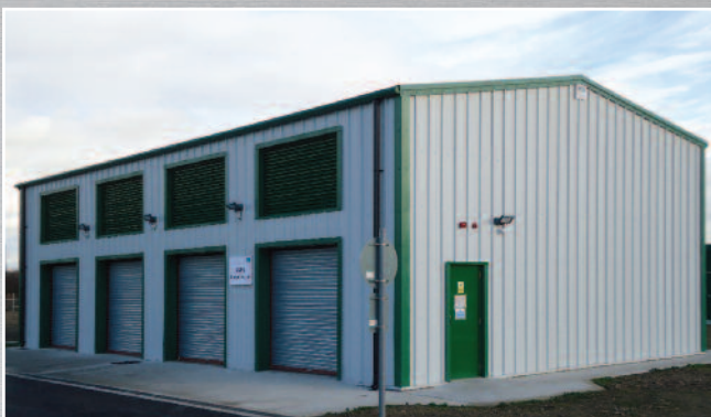
One of our buildings at a water treatment pumping station