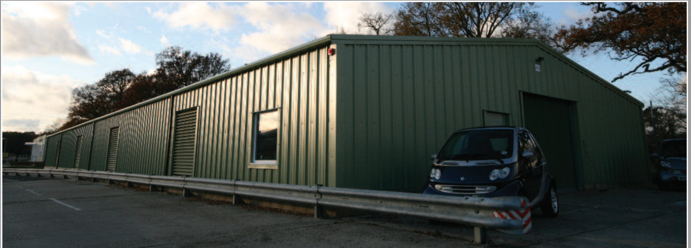
Performance car storage unit with large louvre to enable vehicle periodic run ups

This is a small selection of images showing just some examples of the extensive range of styles and sizes of building we have designed and installed over the years.