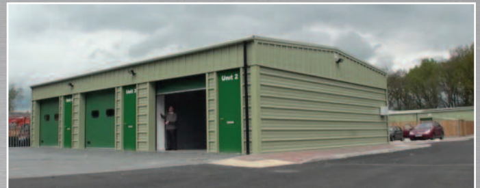
3CB are expert at designing and providing small starter units such as this