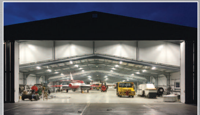
Bespoke aircraft hangar by night supplied with lighting and fire alarm system