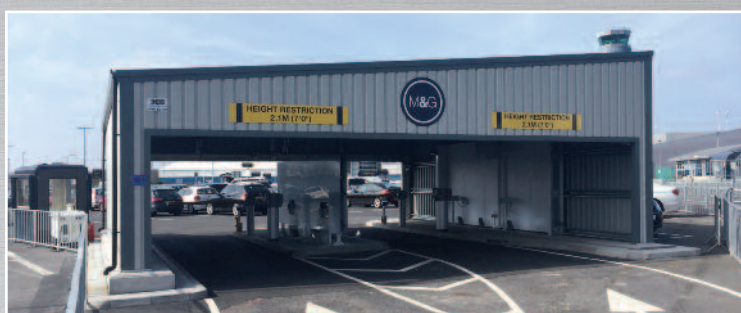
A specialist ANPR canopy building at an international airport parking facility