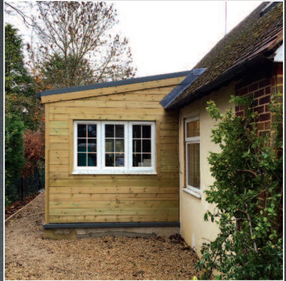
A fully insulated office extension to an existing building