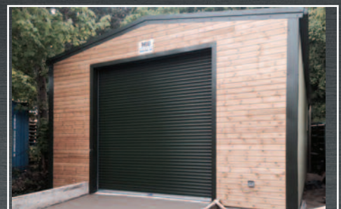
Steel framed workshop with the gable end timber clad to meet planning requirements – neatly bordered by the corner, door opening and barge flashings