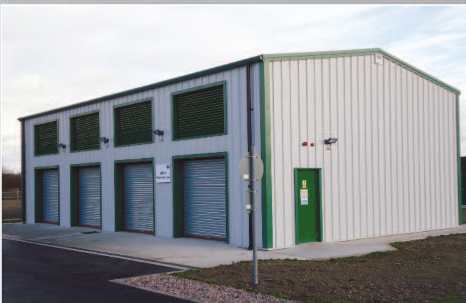
Water treatment pumping station