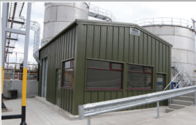
Motor control centre within hazardous chemical facility