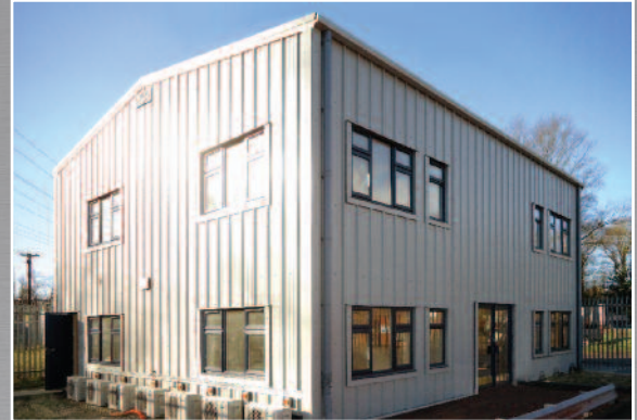
A small office building incorporating mezzanine flooring and total fit out