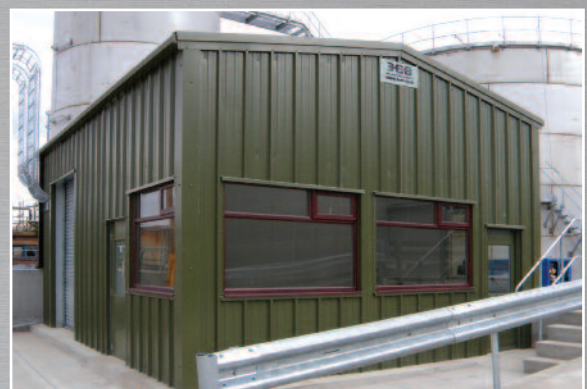
A control room within a hazardous chemical environment