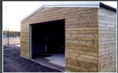
A small facilities building overclad in a tongue and groove boarding