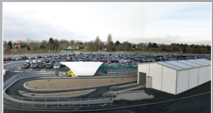
One of our buildings at Heathrow Airport Terminal 5 Parking