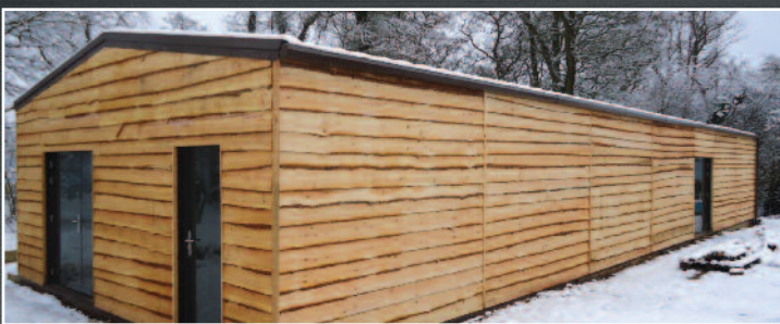
Waney edge boarding system over a fully insulated enclosure as shooting store and ground source heat pump facilities building