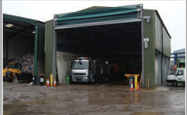
3CB waste handling building with retaining wall enclosure and permeable curtain door