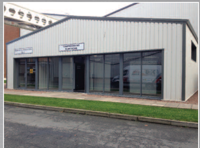
One of our facilities buildings with glazed front and ventilation louvres