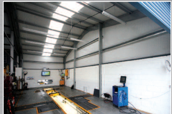
An MOT building incorporating necessary pits, etc