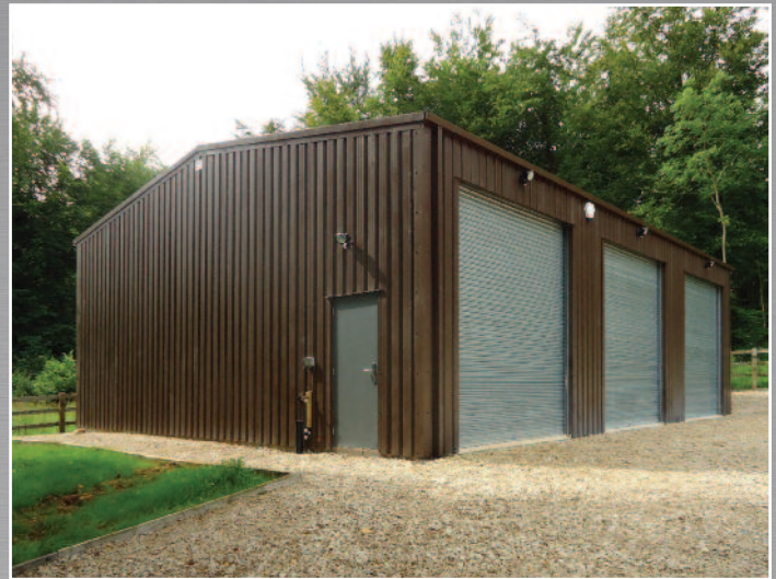
3CB Facilities building finished in Van Dyke Brown

Naturally all of our processes are tightly controlled since we are fully accredited by the BSI to ISO EN standard 9001:2008