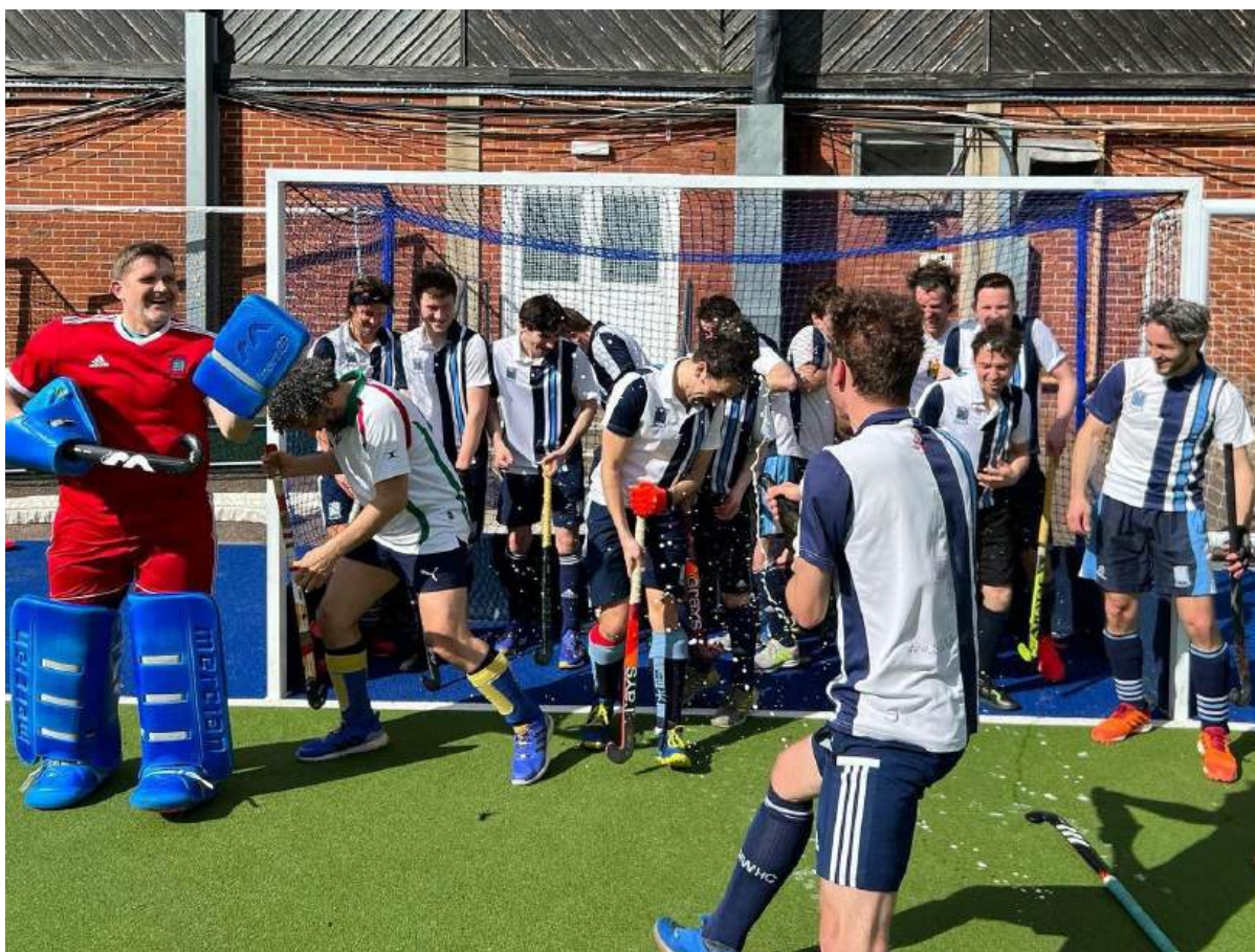
The Men's 4 th XI celebrates