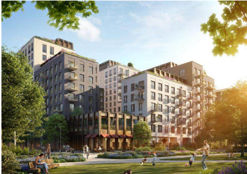
Park view of residential building, Brent Cross Town

Argent Related say that “the extensive playing fields also provide a genuinely unique opportunity – to make Brent Cross the place in London to participate in sport and play, an unrivalled multi-sport destination that will embed values of community, inclusion and active, healthy lifestyles for residents, office workers and visitors”.