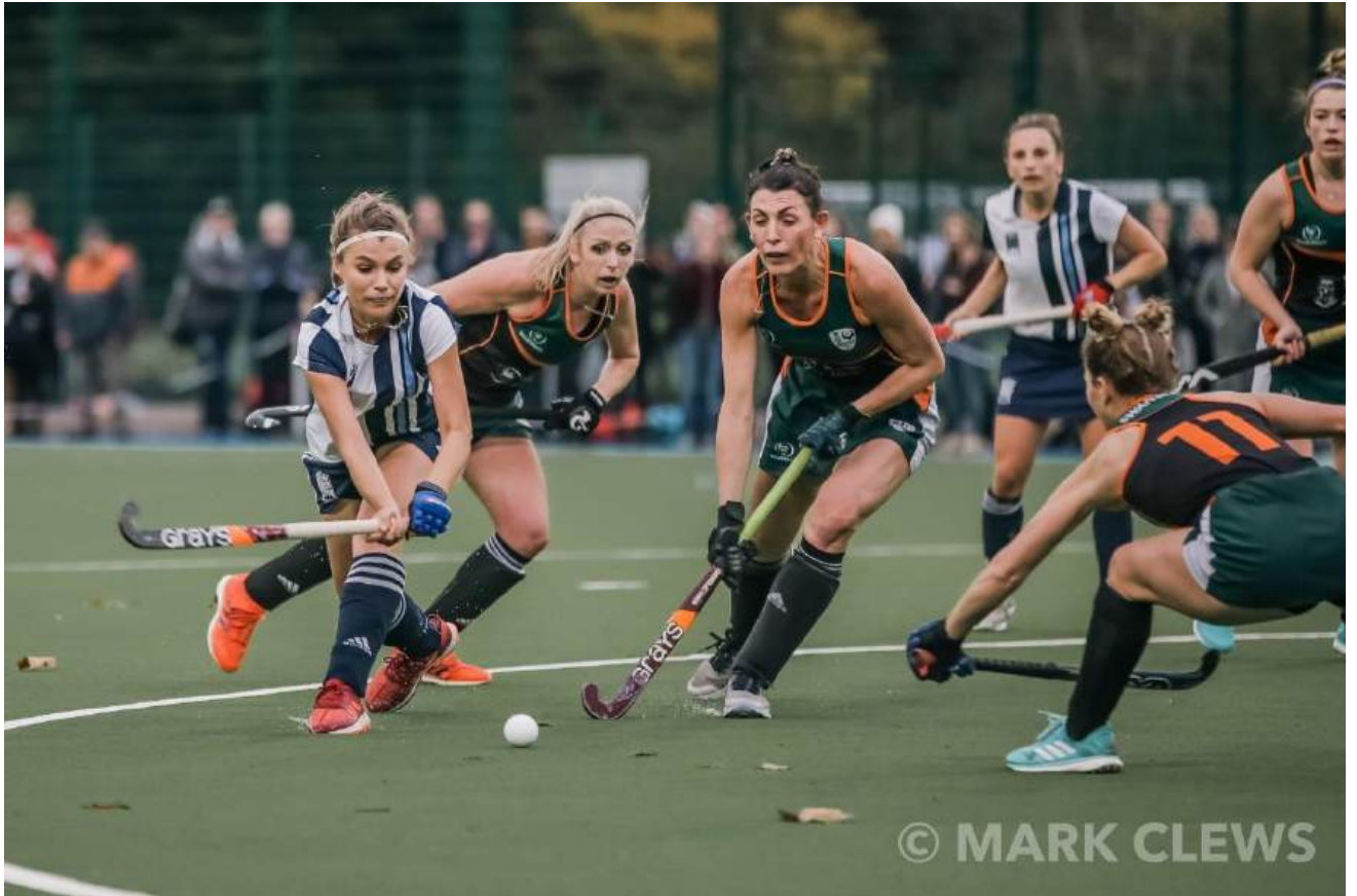
An attack into the Swansea circle at PRG