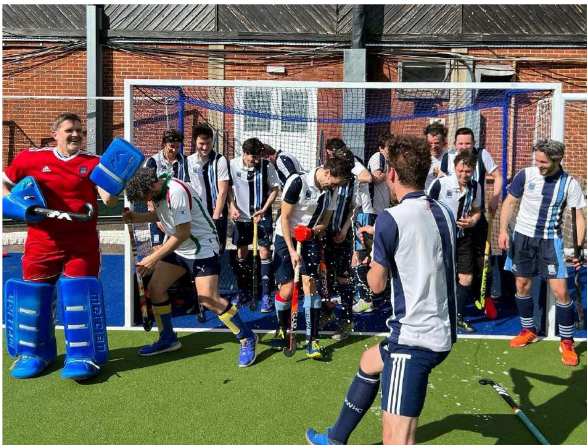
The Men's 4 th XI celebrates