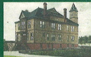
The Old Town Hall

OF THE PLAINVILLE HISTORICAL SOCIETY, INC. ESTABLISHED 1968