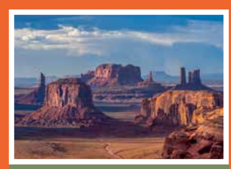
MONUMENT VALLEY TRIBAL PARK

Enjoy a leisurely morning, allowing time for guests who wish to take an optional helicopter tour of the Grand Canyon to do so. We then depart via coach and head south towards Sedona, Arizona. Enjoy lunch in beautiful Flagstaff before reaching the Kaibab and Coconino National Forest. Continue south to experience the world famous Red Rock-Secret Mountain Wilderness. This collection of cliffs, buttes, and canyons has to rank as one of nature's most magnificent masterpieces. It certainly is one of the most colorful. Red is the predominant hue here among these 43,950 acres of wind and water sculpted pinnacles, windows, arches, and slot canyons. Overnight in Sedona, Arizona this evening. B L D