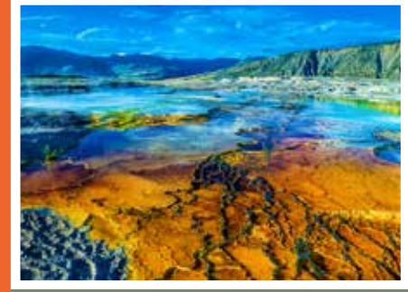
MAMMOTH HOT SPRINGS