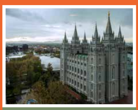
TEMPLE SQUARE, SALT LAKE CITY