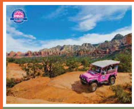
RED ROCK PINK JEEP TOUR

Today, you will enjoy breakfast at your leisure before being transferred to the Phoenix Sky Harbor International Airport for your scheduled flight home. We thank you for joining John Hall's Alaska on a journey through America's most amazing western national parks! B