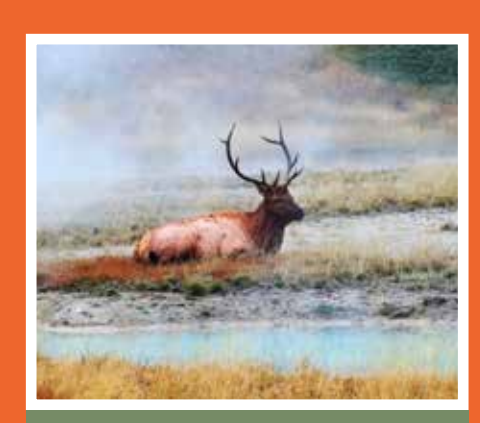
WEST YELLOWSTONE ELK