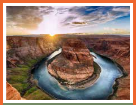
GRAND CANYON NATIONAL APRK