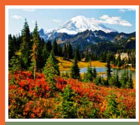
MOUNT RAINIER NATIONAL PARK