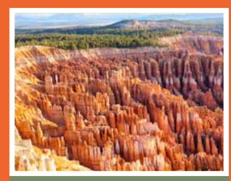
BRYCE CANYON NATIONAL PARK