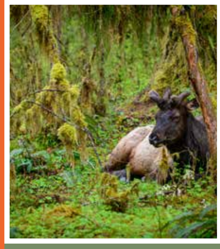
OLYMPIC NATIONAL PARK